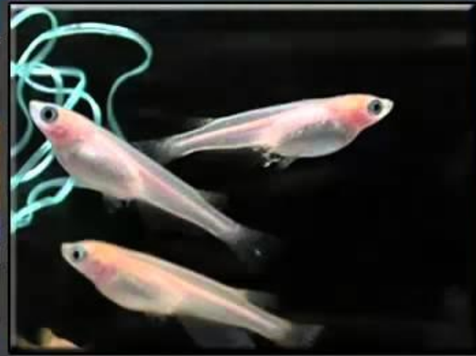
Medaka ( Oryzias latipes )